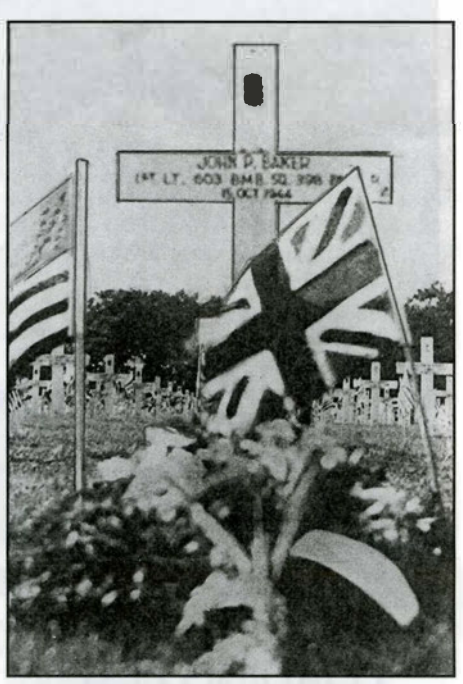
BAKER'S BURIAL SITE Cambridge, England, 1944

Scarcely had these word left my lips when I was frightened thoughtless as I